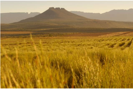
red espesso® Rooibos tea lands